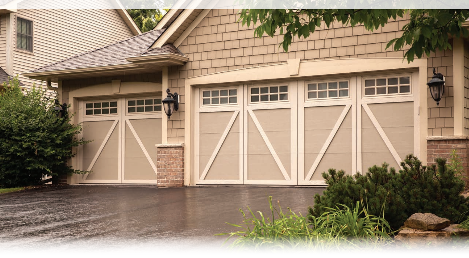
Courtyard Collection® doors give you the beauty of wood with the durability of steel. Each model provides varied design options to complement any home.