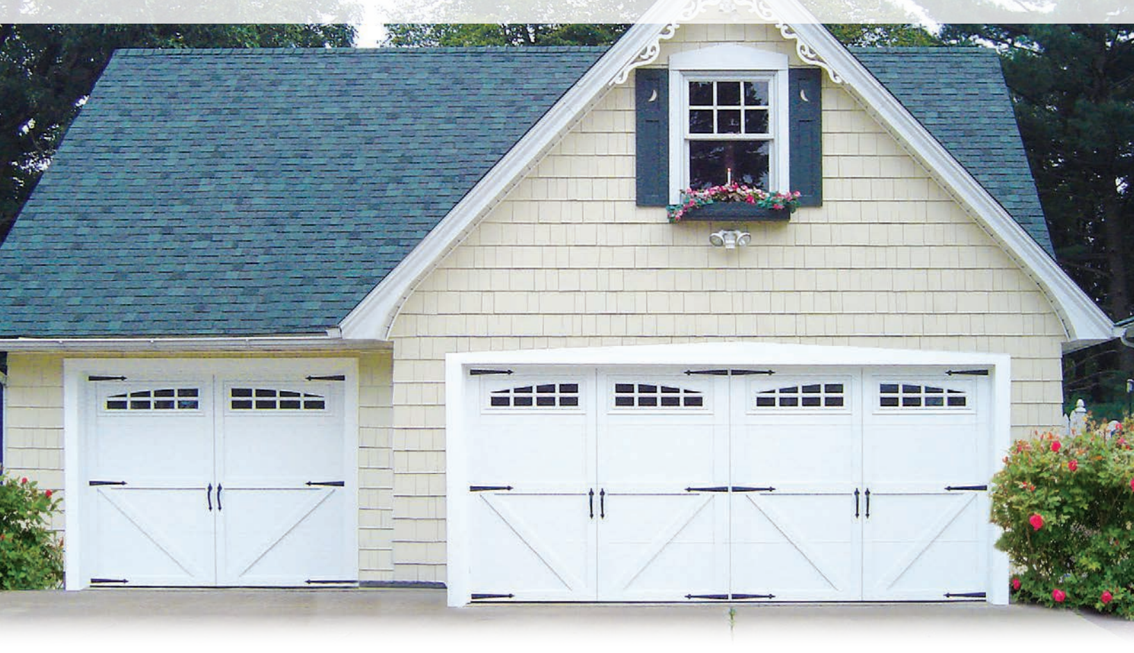
Our Courtyard Collection® features insulated steel construction, fashioned to resemble the elegant wood designs of traditional carriage house doors.